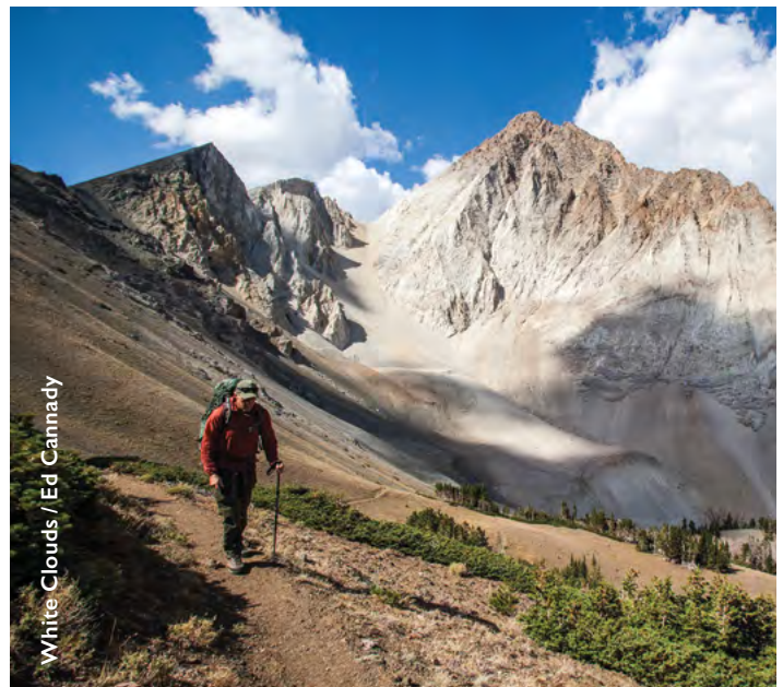
White Clouds / Ed Cannady