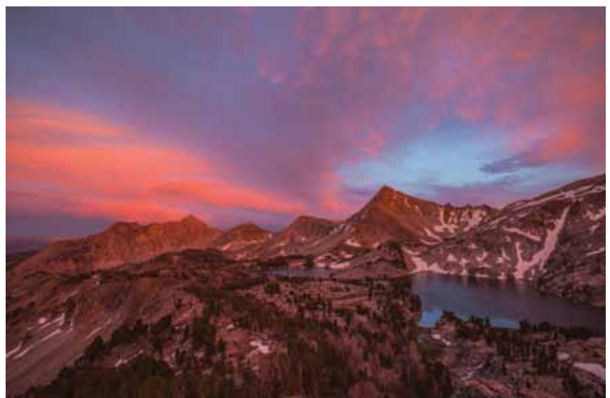
Boulder-White Clouds / Ed Cannady