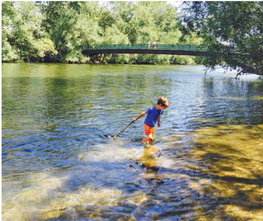
Along the Boise River

In November, Boise voters will have the chance to support a levy to protect and enhance clean water, open space and recreation.