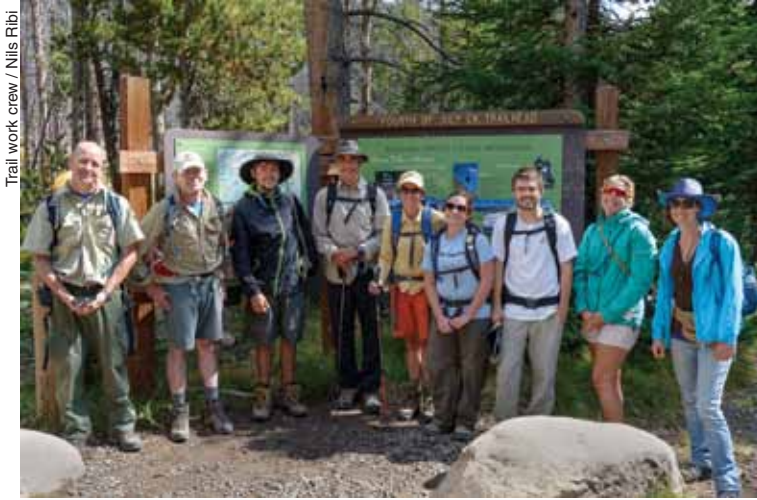
Trail work crew