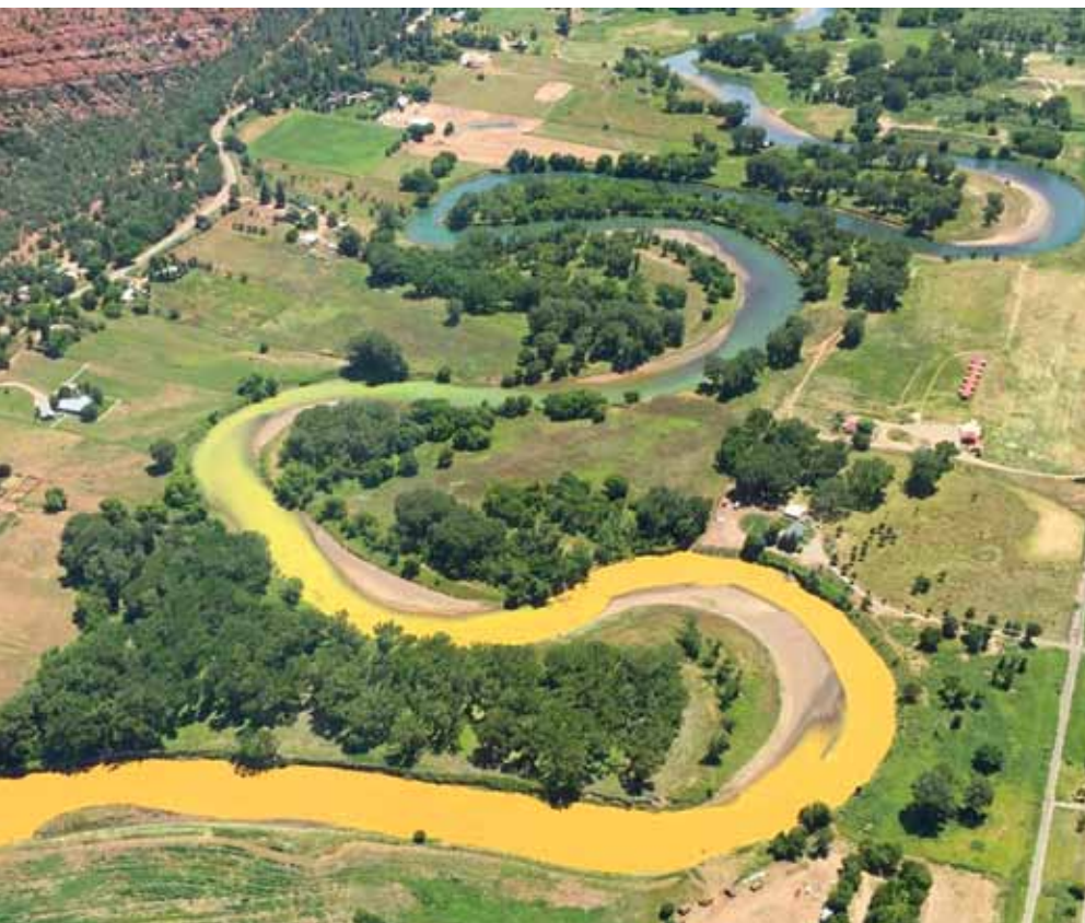
Animas River spill 2015

The moment the plume of pollution headed down the Animas River was caught by Albuquerque's television station KOB's news helicopter in this extraordinary image.