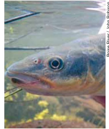
Boise River

In November, Boise voters will have the chance to support a levy to protect and enhance clean water, open space and recreation.