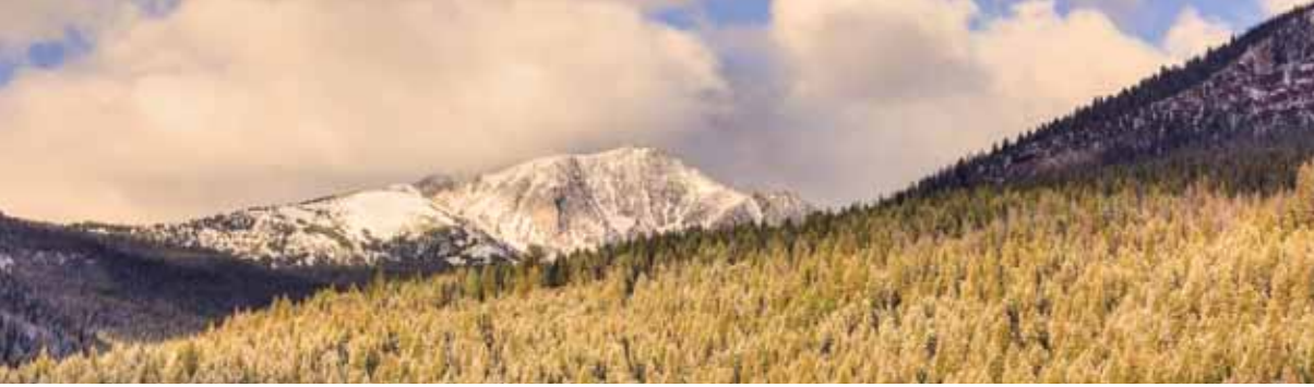
Boulder-White Clouds / Ed Cannady