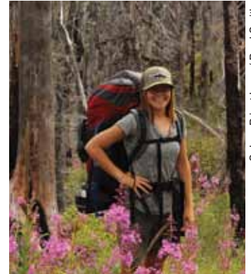
Salmo-Priest Loop