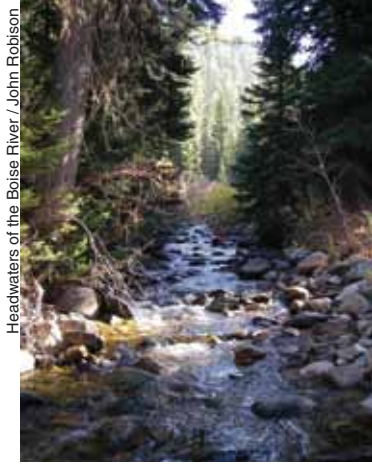
Headwaters of the Boise River

Images of the mine spill on the Animas River in Colorado stunned people throughout Idaho. A once-vibrant, clear blue river was transformed into a toxic orange ribbon. Could anything like this happen to Idaho's rivers? The answer is yes. For one, it could happen to the Boise River, an important river that provides water for drinking, irrigation, recreation, fish and wildlife and is regarded as the heartbeat of the Boise community.