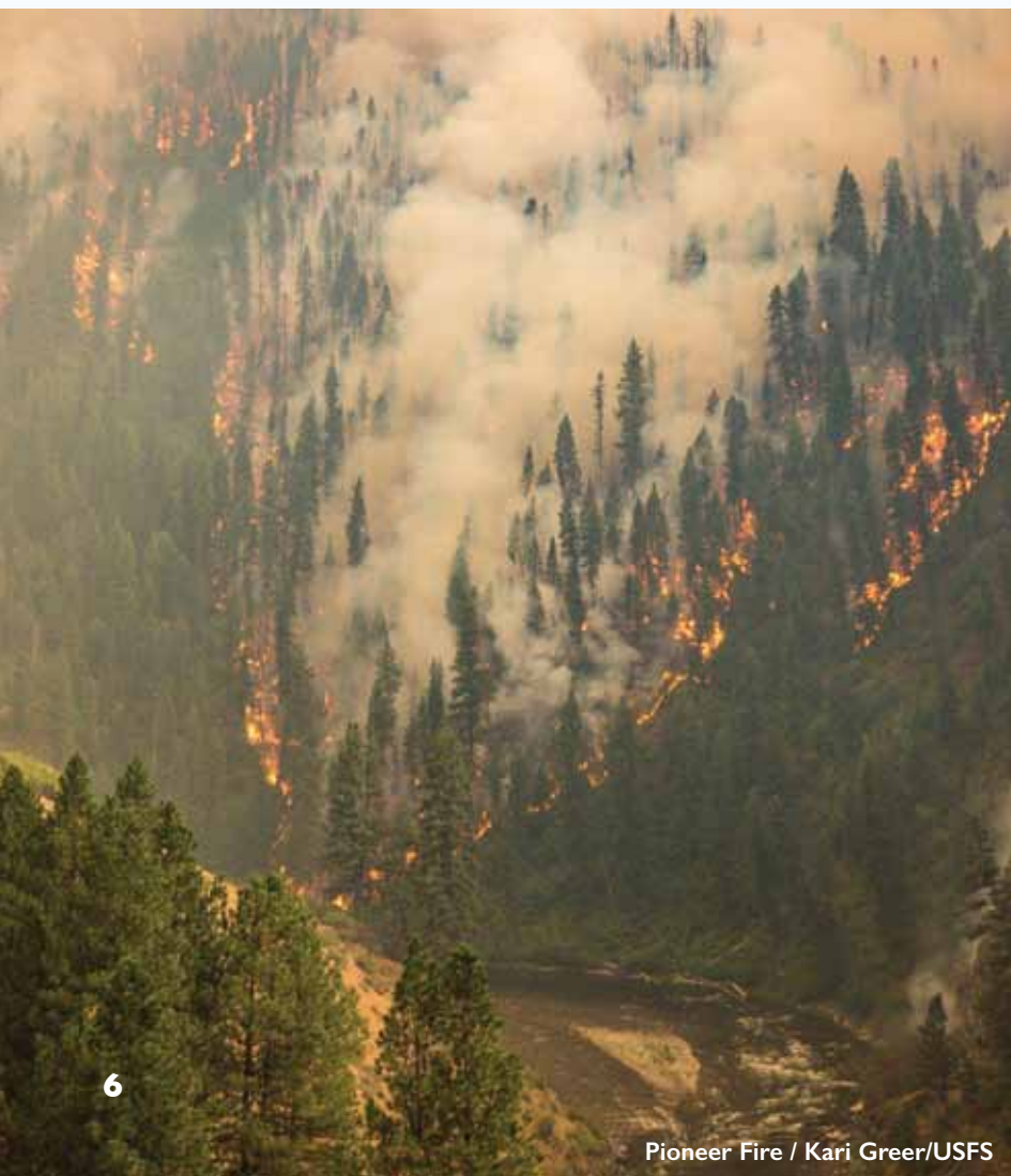
Pioneer Fire

ICL is also addressing the root cause of global warming by helping Idaho transition from fossil fuels to clean energy. Anything less and we will “miss the forest for the trees.”