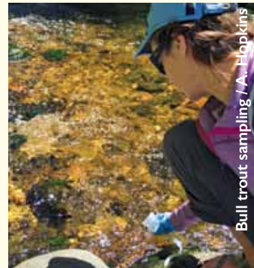
Bull trout sampling

Conservation Assistant ahopkins@idahoconservation.org