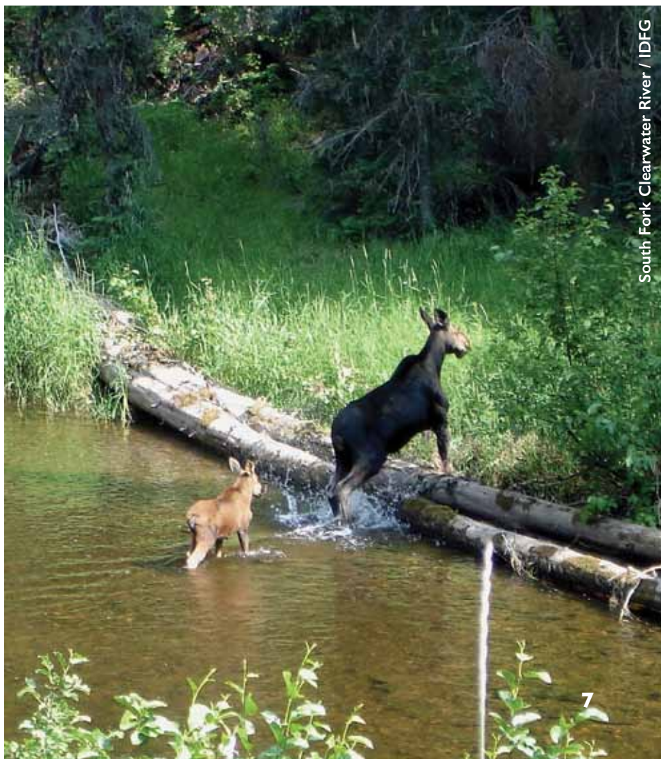
South Fork Clearwater River