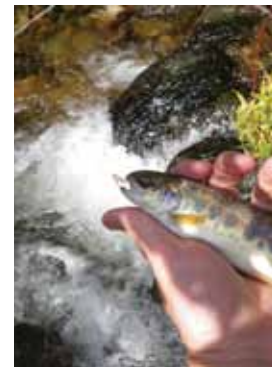
Redband trout