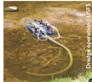
Dredge operation

As we've said before, clean water is a priceless asset—just because a small group dislikes the rules, it doesn't mean that they can break them.