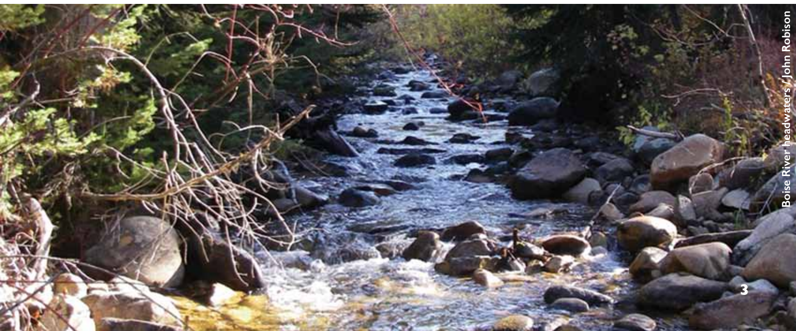
Boise River headwaters