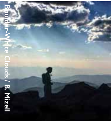
Boulder-White Clouds

Our volunteer stewards are playing a valuable role for the Forest Service and acting as extra eyes and ears for Idaho’s new wilderness areas—the Hemingway-Boulders, White Clouds, and Jim McClure-Jerry Peak—and the Sawtooth Wilderness. With over 493,000 acres of federally protected wilderness in Central Idaho, it’s a big job and ICL is happy to help.