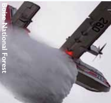
Boise National Forest

With a deep snowpack in the mountains and above-average spring precipitation, Idaho’s fire season was forecast as moderate to average. So far, that prediction has been on target, though we have learned lessons from our 2016 fires.