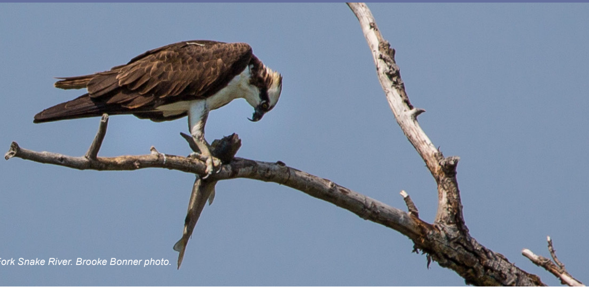
An osprey enjoys its catch on the South Fork Snake River.