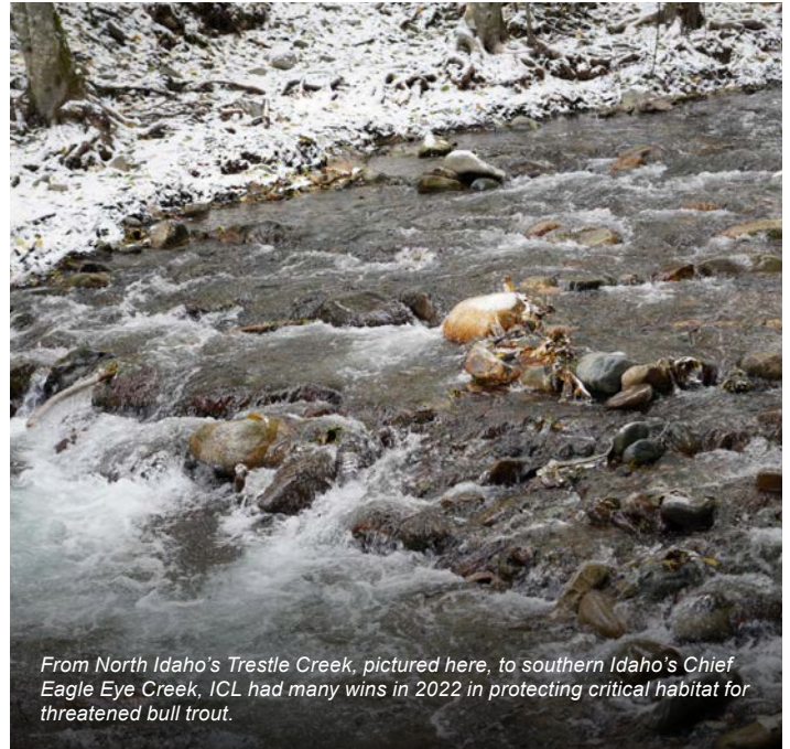
From North Idaho's Trestle Creek, pictured here, to southern Idaho's Chief Eagle Eye Creek, ICL had many wins in 2022 in protecting critical habitat for threatened bull trout.