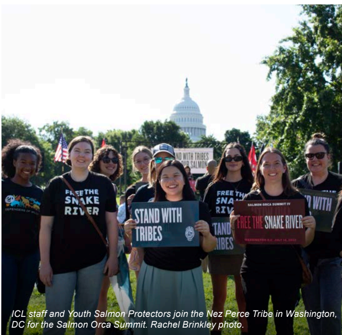
ICL staff and Youth Salmon Protectors join the Nez Perce Tribe in Washington, DC for the Salmon Orca Summit.

Recognizing that these fish would already be gone if it weren't for the work of Northwest indigenous Tribes, ICL remains steadfast in our support of Tribes and their calls for action, and we use our platform to share the vital work of Tribes with the public.