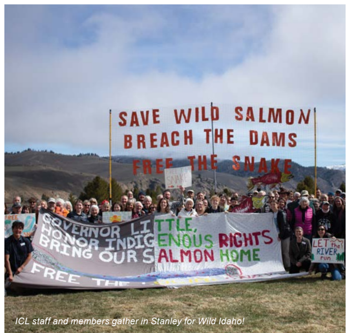
ICL staff and members gather in Stanley for Wild Idaho!