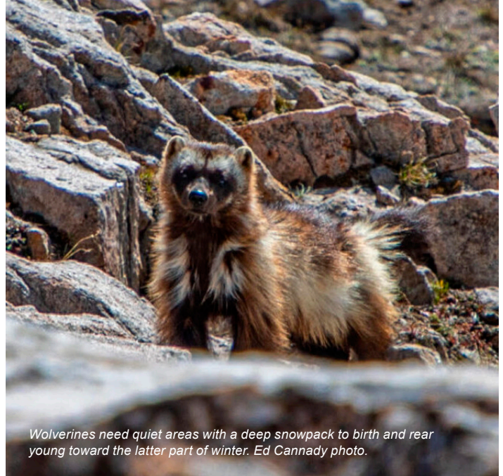
Wolverines need quiet areas with a deep snowpack to birth and rear young toward the latter part of winter.

plan for the Bonners Ferry, Priest Lake, and Sandpoint Ranger Districts. ICL served as a voice for wildlife, and advocated for approximately 270,000 acres to be closed to snowmobile use all winter to protect wildlife such as wolverine, mountain goat, and lynx. Snowmobile use would also be restricted to designated trails annually starting in April on the remaining 622,000 acres of the planning area to protect grizzly bears when they emerge from hibernation. Final approval of the plan is expected in late 2023.