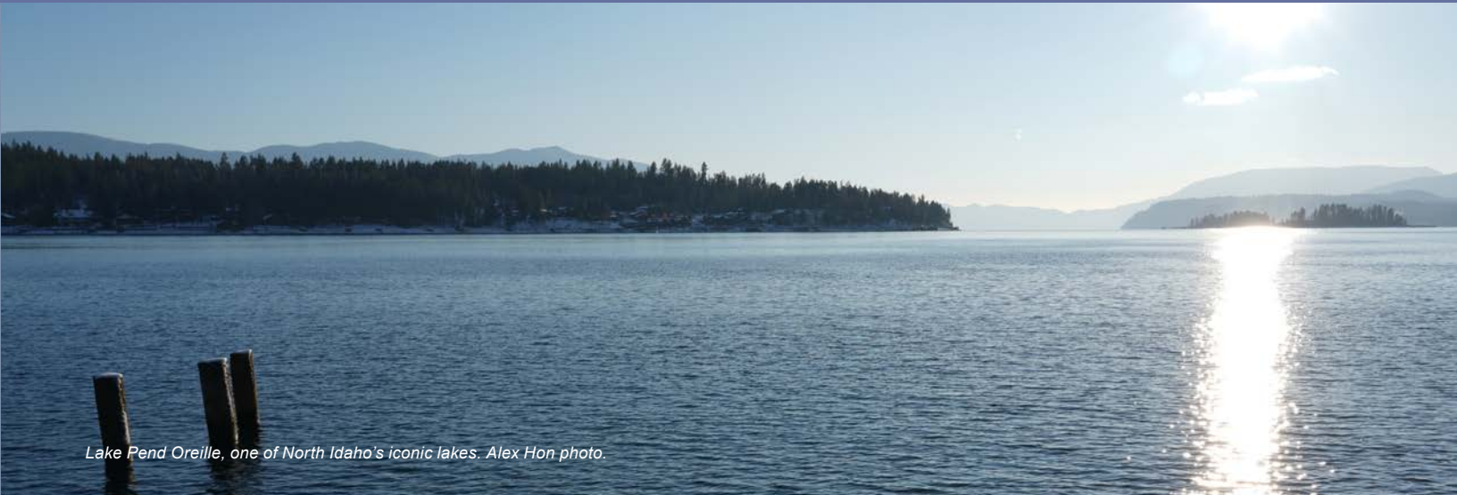
Lake Pend Oreille, one of North Idaho's iconic lakes.