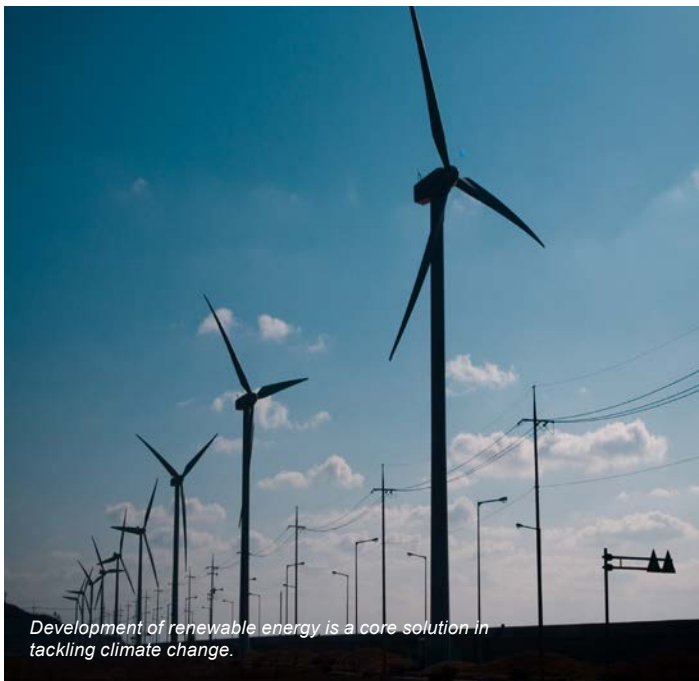
Development of renewable energy is a core solution in tackling climate change.

This year was a busy one for ICL at the Public Utilities Commission (PUC). ICL participated in cases there that led to Idaho Power committing to exit and decommission its Valmy coal plant by 2025. Our intervention also led Idaho Power to accelerate its timeline for conversion and/or closure of several units of the Jim Bridger coal plant in Wyoming. Coal burning at Jim Bridger is now expected to cease in 2028, making Idaho Power's portfolio coal-free two years earlier than expected.