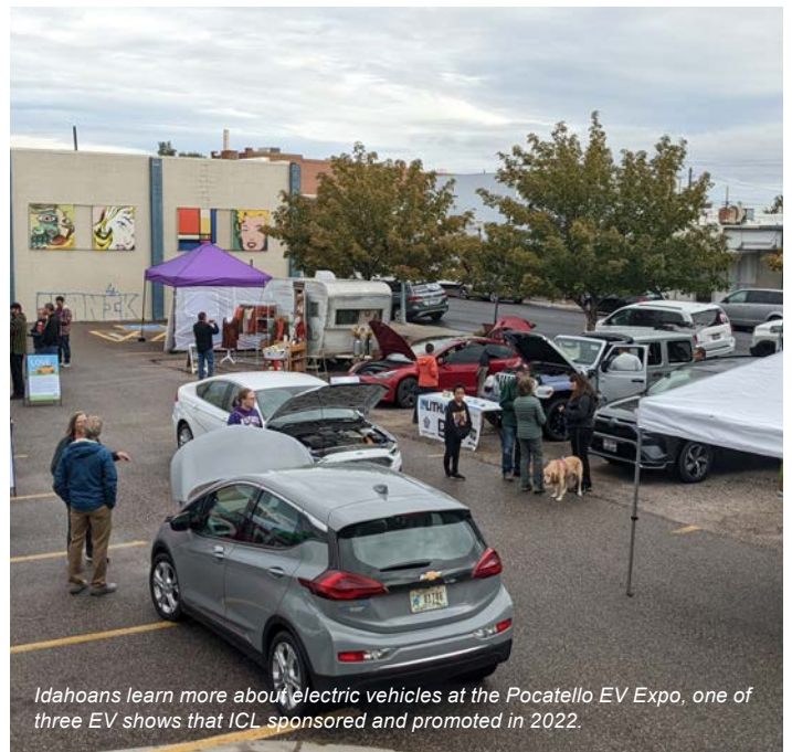
Idahoans learn more about electric vehicles at the Pocatello EV Expo, one of three EV shows that ICL sponsored and promoted in 2022.