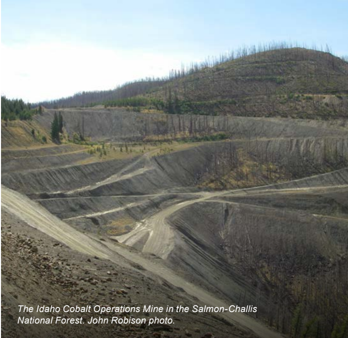
The Idaho Cobalt Operations Mine in the Salmon-Challis National Forest.